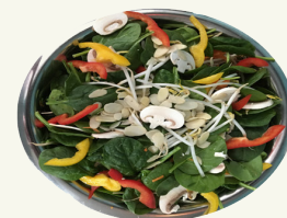
Spinach and almond (extra $0.50 per person)