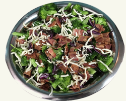
Broccoli and bacon (extra $0.50 per person)