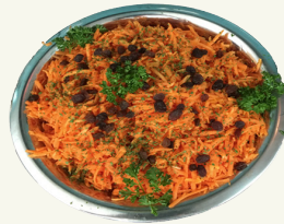
Carrot & grapes